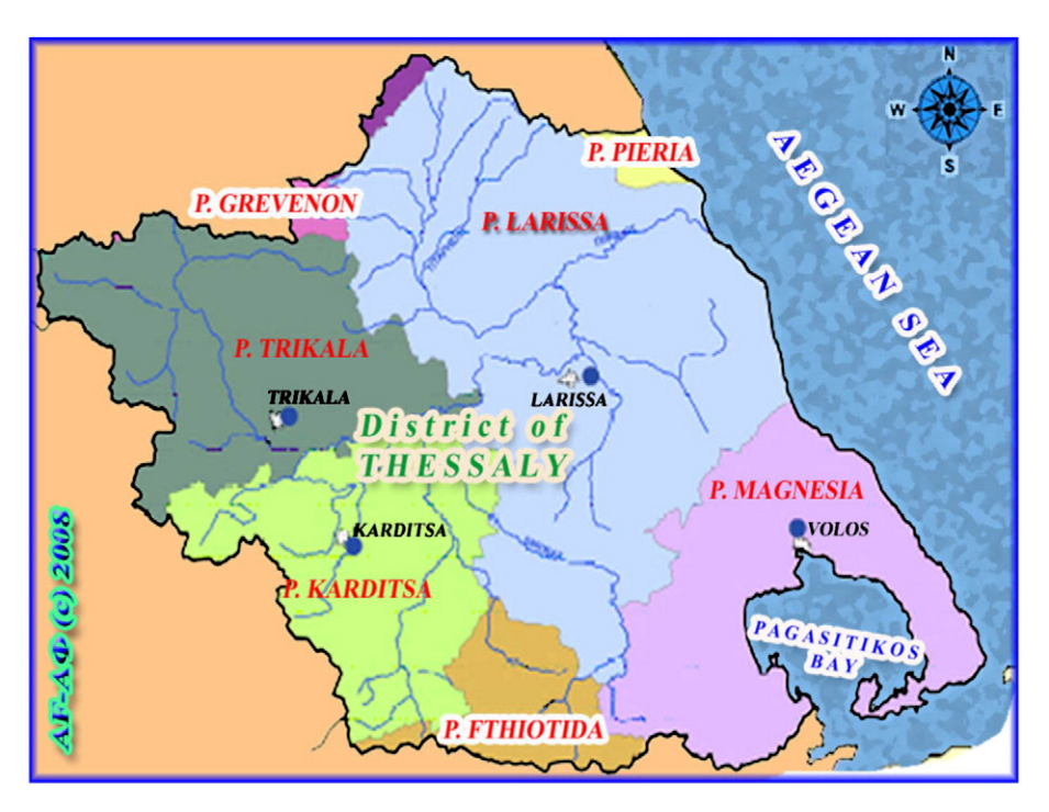
Fig. 1. Thessalian basin in central Greece with the major watersheds.

The quality of surface waters is generally in a good state with some exceptions [8,9]. But as confirmed, by the new EP.PER.S.D. 2006–2013, all the above have not yet been applied to agriculture [2]. According to the regulation 91/676/EU "for the protection of waters from pollution caused by agricultural activities", Thessaly is characterized as a sensitive zone [6] (Greek law 99652/1906/99). This includes all measures taken for land protection, the "codes of rational agricultural practice" and the action program for their promotion and application. A national network of monitoring, organized by the Ministry of environment, regional planning and public works (Y.PE.XO.DE) has been functioning since 1998 and offers a chemical analysis and the time fluctuations of certain quality points, but it does not include the biological points of quality or